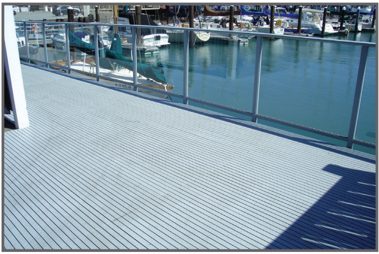
Corinthian Yacht Club Harbor in San Francisco, California.