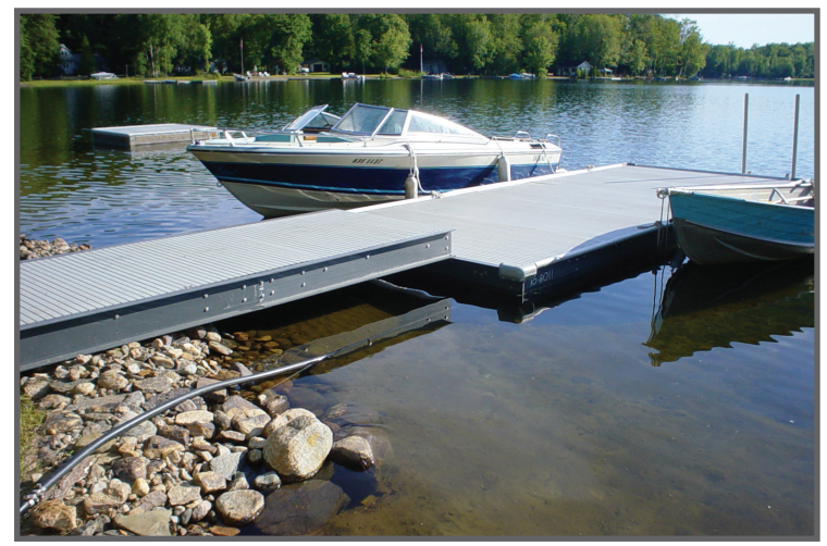
Boat dock on Horseshoe Lake in Haliburton, Ontario.

Aqua Grate is available in a variety of lengths and widths, making it useful for a number of waterfront and recreational applications. The fine grit surface of Aqua Grate provides a high level of slip resistance, yet at the same time offers a comfortable barefoot walking surface. Protection against long-term UV exposure is provided by a synthetic surfacing veil and UV inhibitors in the resin formulation. Whether subjected to chlorinated water in public and private pools or salt water environments found in marine and waterfront applications, Aqua Grate will offer years of low cost, low maintenance service.