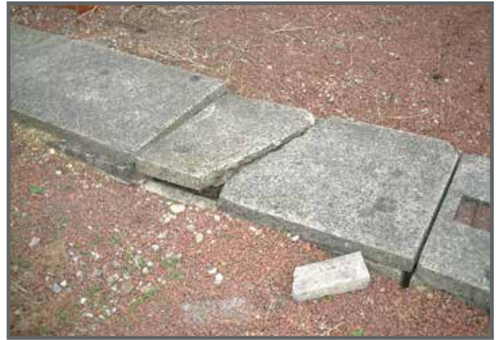
Traditional Concrete Trench Covers

Why not provide an aesthetically pleasing Fibergrate FRP cover that will continue to provide durability and safety for years to come?