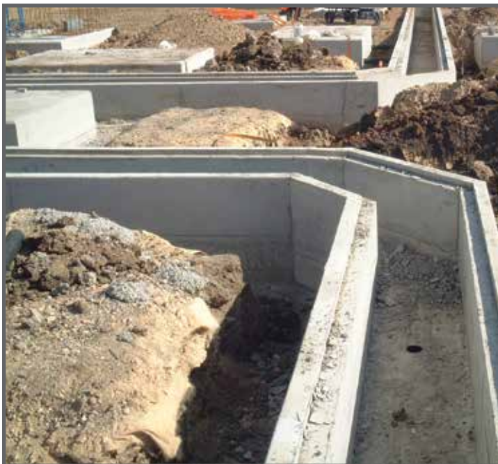
During Construction of Utility Trench